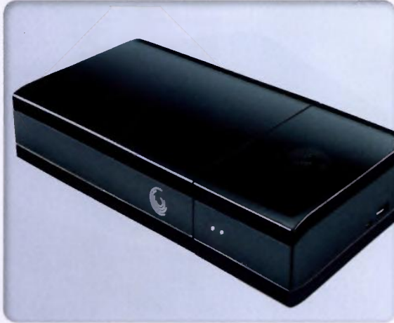
Cinema goer The Seagate GoFlex Cinema is small despite its huge capacity, but there are some failings with the drive